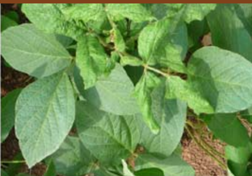
Figure 9. Mosaic disease-affected soybean plants.