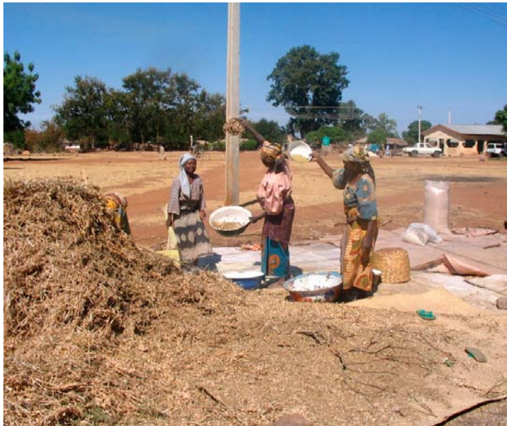
Figure 12. Manual threshing of soybean.