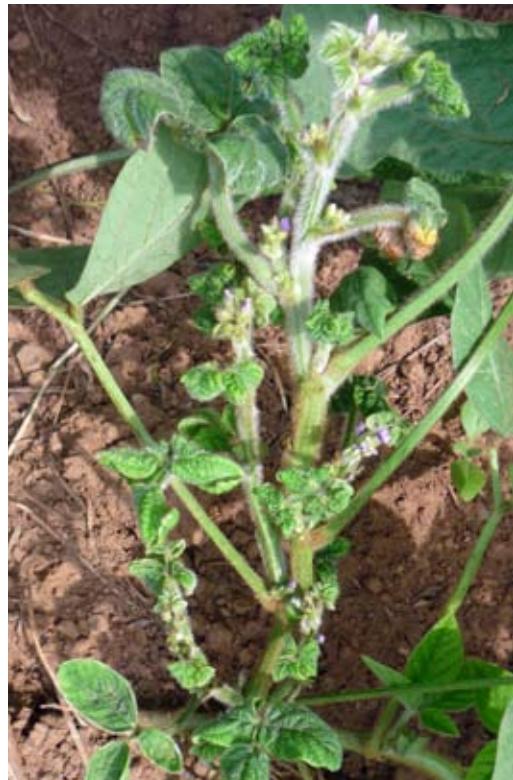
Figure 11. Dwarf disease-affected soybean.

Dwarf disease: The causal virus responsible for soybean dwarfing disease is not known. This disease occurs in low frequency in the fields. Leaves and shoots of the infected plants are severely stunted with severe reduction in leaf lamina (Fig. 11). Infected plants do not produce any pods.