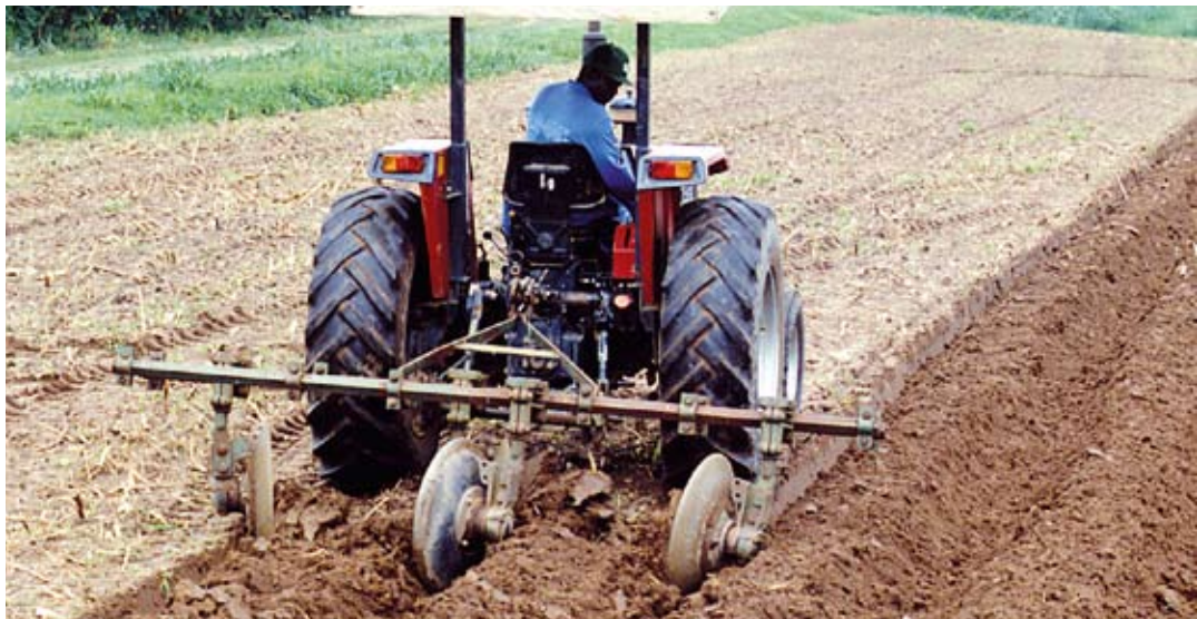
Figure 1. Preparing land for soybean production using a tractor.