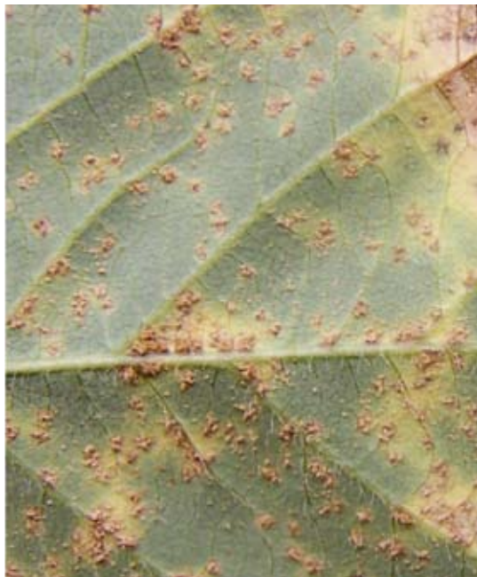
Figure 5b. Large number of spores on the lower surface of tan lesions of soybean rust.