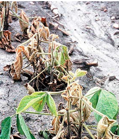
Figure 7. Phytophthora seedling blight causing wilting of older seedlings.

the lower surface (Fig. 6). The elevated pustules sometimes have cracks in them. Later lesions join together and the dead areas tear away to give a ragged appearance to the leaves. Symptoms of rust and bacterial pustule sometimes appear similar.