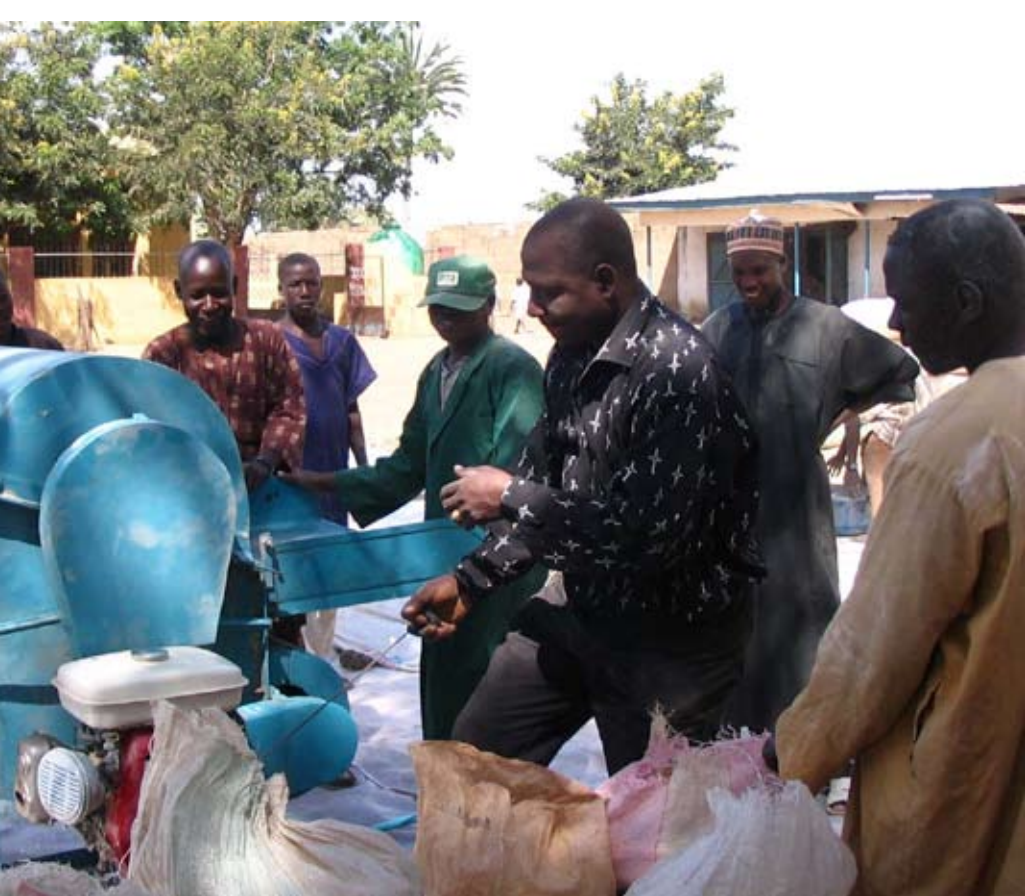
Figure 13. A multipurpose soybean threshing machine.