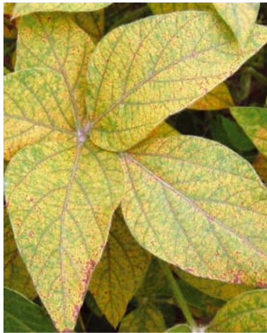
Figure 5a. Rust-infected soybean leaves with large number of small tan lesions.

Bacterial pustule: The disease is caused by Xanthomonas axonopodis pv. glycines . Symptoms appear as specks to large, irregular spots with raised light-colored pustules in the elevated centers of the spots on