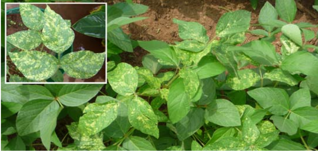
Figure 10. Bright yellow mosaic symptoms caused by begomovirus infection in soybean plants.

was found to be less frequent in the fields. Virus-infected plants produce bright yellow mosaic or specks, and develop into large blotches on the leaf lamina (Fig. 10), but this infection does not result in leaf distortion or reduction in lamina size. Mixed infection of these two begomoviruses and CPMMV are common in the fields and such infection results in bright yellow mosaic symptoms and leaf puckering.