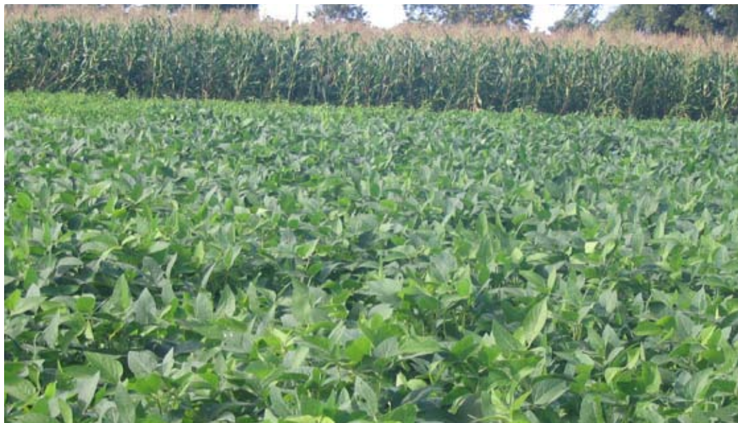
Figure 4. Soybean in rotation with maize.