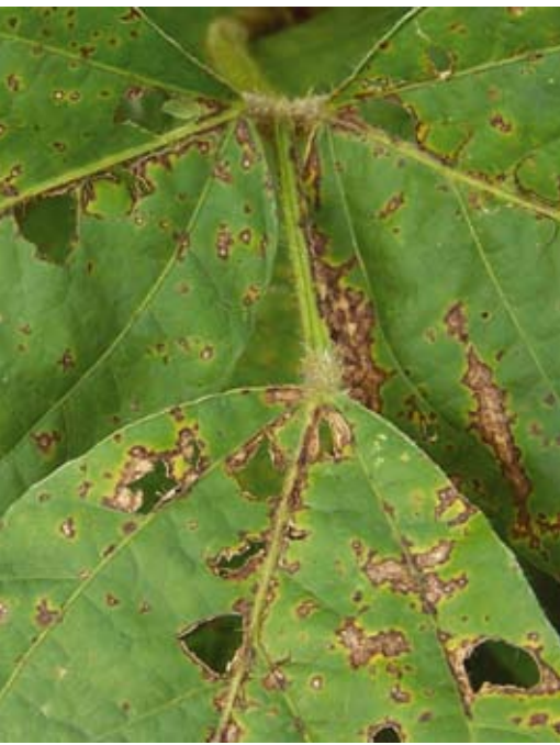
Figure 6. Small spots and coalescing lesions of bacterial pustule disease.