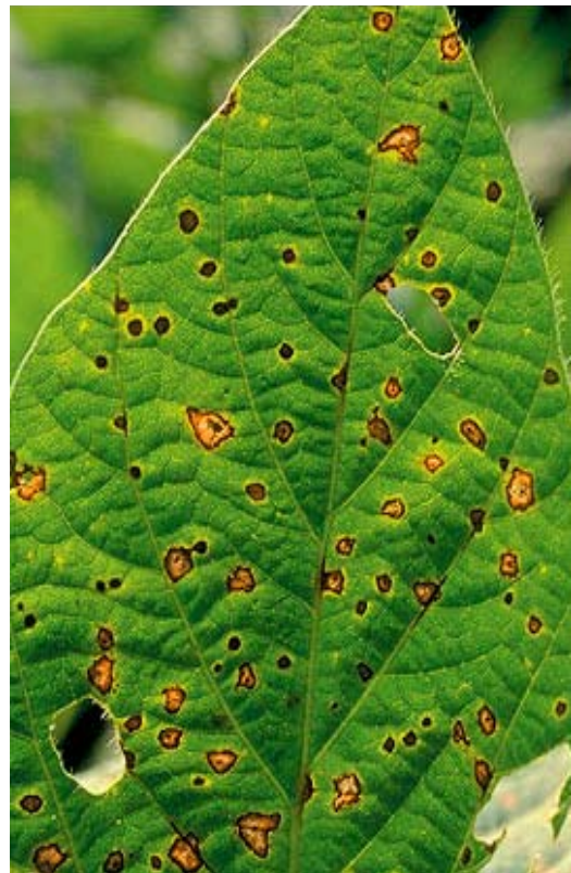
Figure 8. Initial symptoms of frogeye leaf spot.